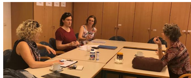
LS reflection meeting 2